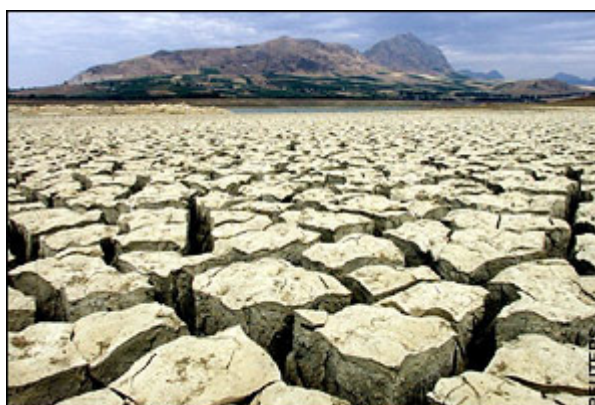
Biblical droughts, floods, plagues and extinctions?

Last week, Gordon Brown and his chief economist both said global warming was the worst "market failure" ever. That loaded soundbite suggests that the "climate-change" scare is less about saving the planet than, in Jacques Chirac's chilling phrase, "creating world government". This week and next, I'll reveal how politicians, scientists and bureaucrats contrived a threat of Biblical floods, droughts, plagues, and extinctions worthier of St John the Divine than of science.